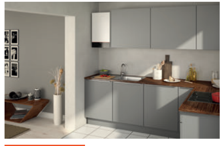
H<sub>2</sub> READY 20%

Compact and efficient wall-mounted gas condensing boilers, economical to run and exceptional value