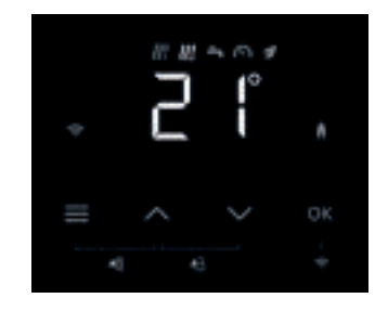
LCD touchscreen display