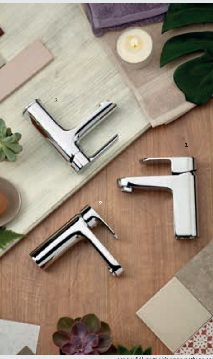
For our full range visit www.methven.com or ask in store for more details