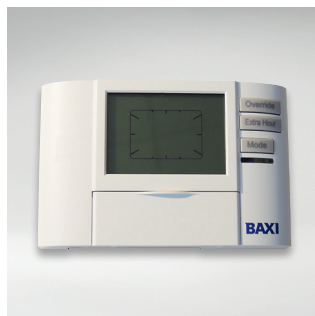
7212444 Baxi single channel wired programmer