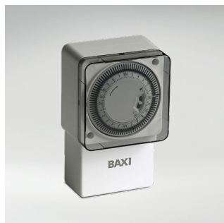
720971401 Baxi wall mounted 24hr mechanical timer