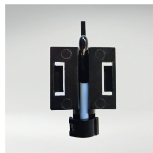
7683084 Baxi IFOS In Flue Outdoor Sensor Kit