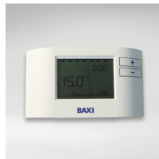
7212438 Baxi single channel wired programmable thermostat