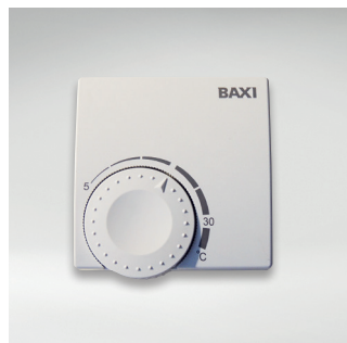
720971601 Baxi wired room thermostat

The range of Main Eco Compact Combi controls that can be fitted quickly and simply.