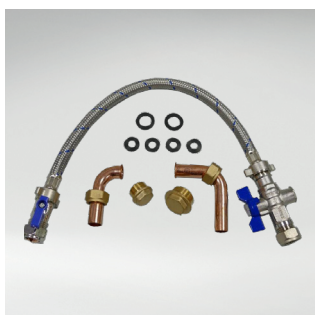
248221 Multifit filling loop