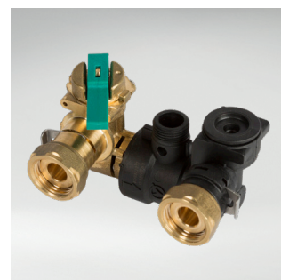
7665482 Multifit Easy-Fill