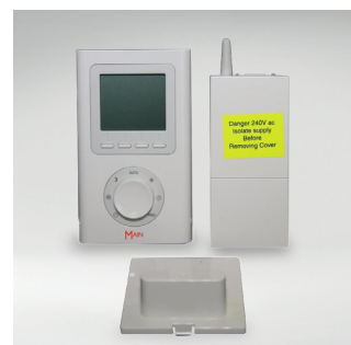
720030701 MAIN RF digital 7 day programmable roomstat