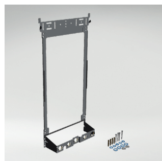
7715591 Main Eco Compact Pre-Plumb Jlg