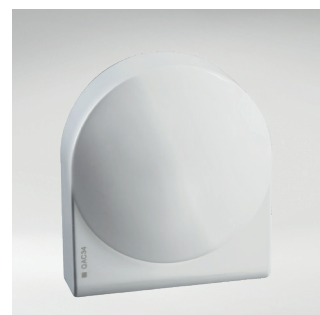
7703233 On wall outdoor sensor