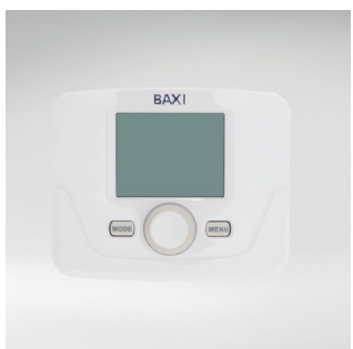
720644801 BAXI programmable 7 day wireless sensor (2 channel) (twin channel programmer for system)