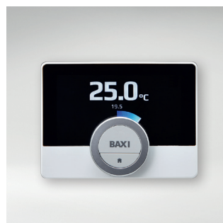
7649277 Baxi uSense wired smart thermostat